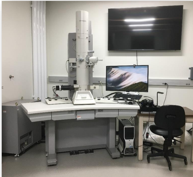
UWSP's Hitachi H-7500 Transmission Electron Microscope

In-Person class sessions: Friday-Sunday, 15-17 October 2021